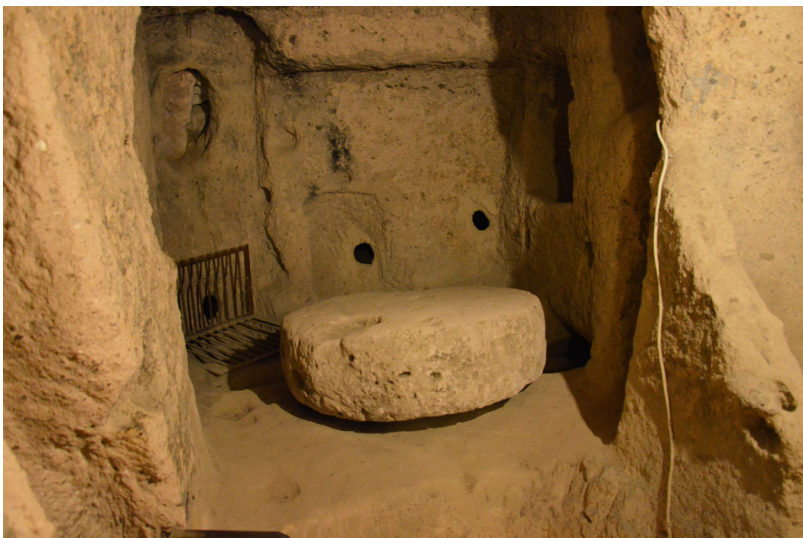
Figure 6: Interior of Cave

Q: So, they are dangerous to all others?