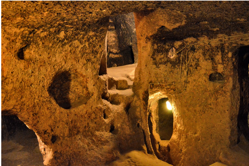
Figure 5: Interior of caves