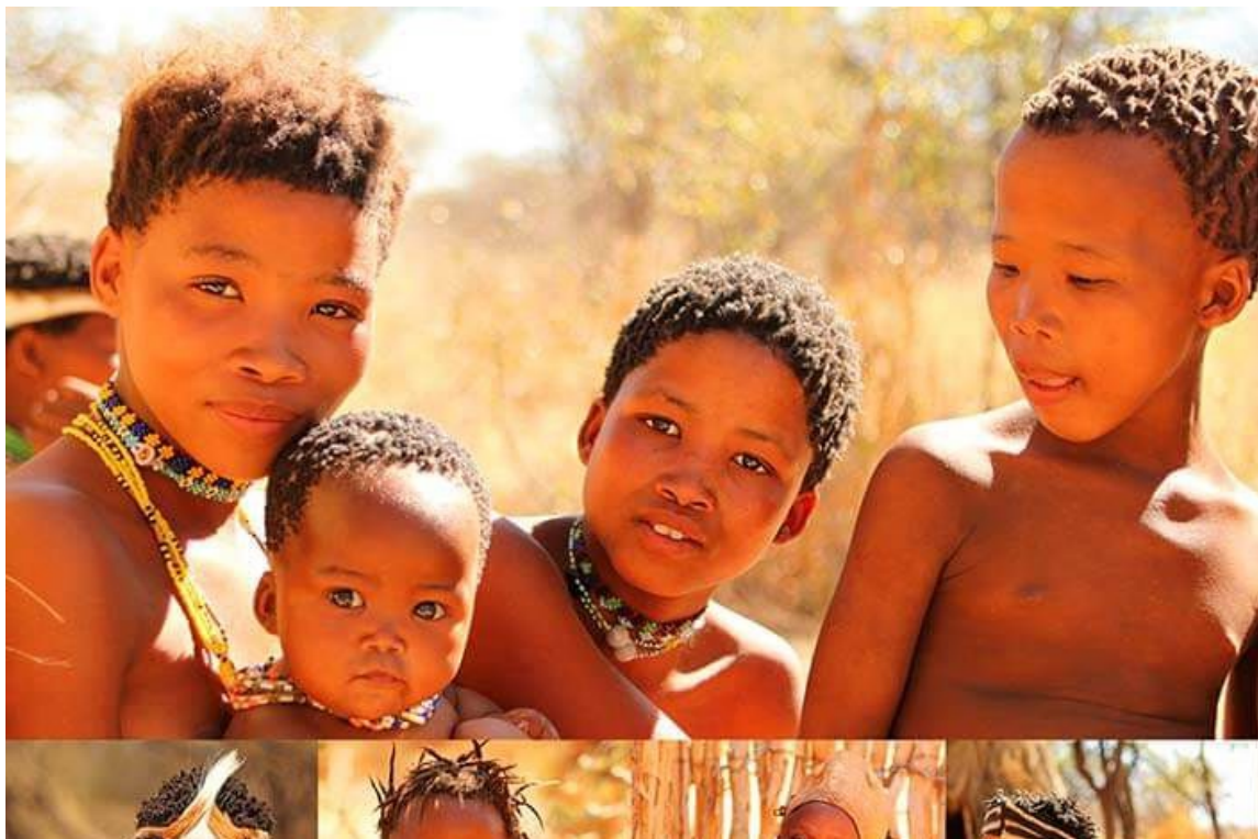
Figure 2: Sans People

A: First from the Indian Ocean and crawled on to the land of Antarctica later called Egg Island . And from there many crossed over to South Africa where they later were called Sans People , a word that means to “migrate” Hebrew Strong’s Number 6629 צָאֵן TSON, San . In Psalm 144:13 you see it there used as “migrate”, it is also used as sheep , flock . In Genesis 4:2-4 you see them as the offerings to the Yahweh “Lord” as food; the Anakim or Anunnaki , the Bible calls Hebrew Strong’s Number 430 אֱלֹהִים Eloahim “deities” called Lulu Àmelu , big sheeps or flocks, just as the Amorites do to other beast of burden, and they had bestiality.