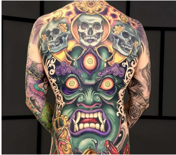
Figure 9: A Japanese Tattoo

These are who these people really are and where they are from. If you look into their Indian cultures' symbols, artworks, dialects you will see the dragon, just by new attributes. The colors beadworks drums, dances are all the same as Asia, just watered down a bit. So who were the original people on this part of the planet? Well that also has been found and proven. A TV show hosted by Megan Fox, uncovered bones deep underwater in caves here in America. From before the lands of America and Africa separated called continental drift, there was one land mass called Ganawah and when they examined the female bones found, her DNA trees back to Homo-Habilis of Africa today. So, they did a skull reconstruction to see what she may have looked like, and it turns out she was an exact match for a San person of South Africa , showing and proving they migrated Northward and then just walked over Westward to this part of the earth back then. They named her Mayah "illusion" and later tried to change the reconstruction to look more European. Yet we already had a copy of the original. Those were the first people here called An-Nasari or Annasar , Annazarzi people.