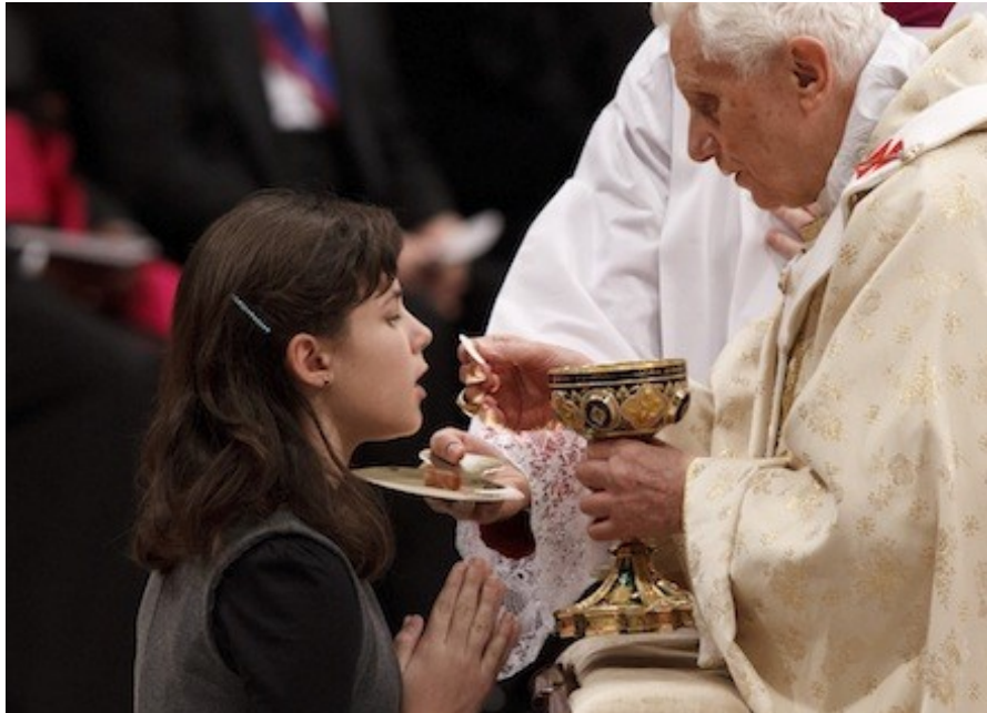
Figure 3: Eurochrist

Q: So, you're saying the deities by which ever name were aliens or extraterrestrials from outer space?