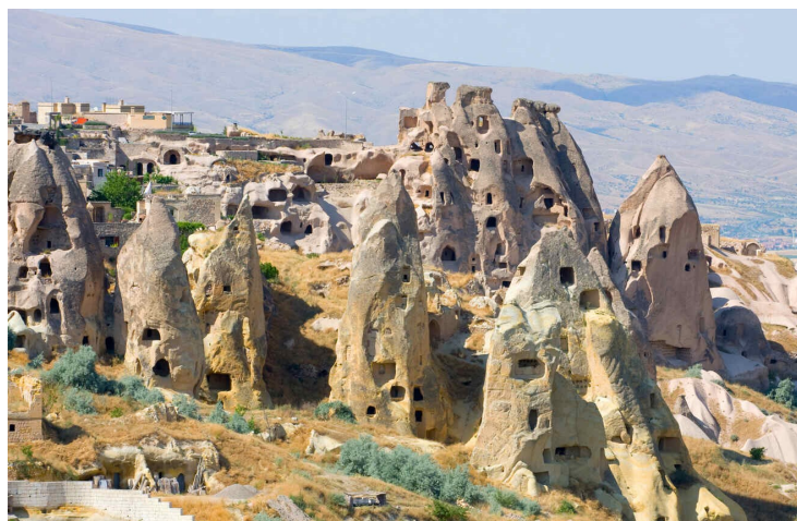
Figure 4: Turkey Cave, Cappadocia