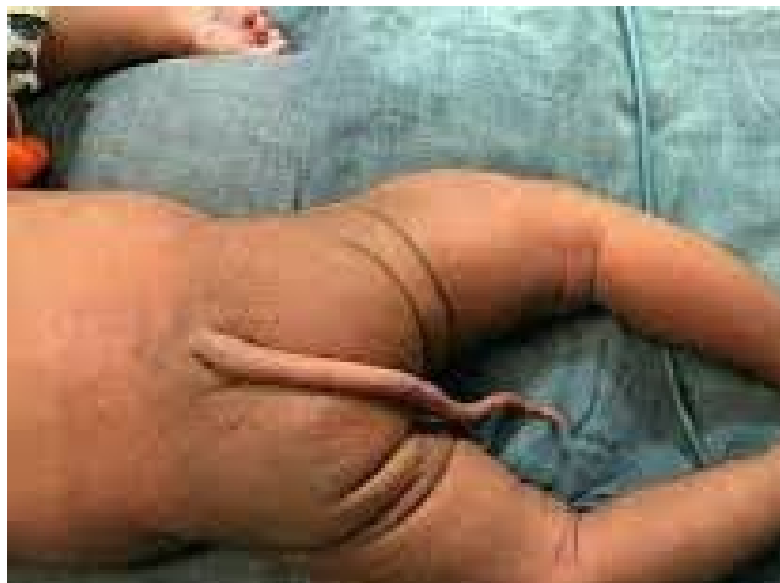
Figure 7: Baby with Coccyx

A: Well, in fact there is, they are called the Basque . They were grafted and made by thePleiadean from that star system. Job 9:9 mentions them, " Which maketh Arcturus, Orion, and Pleiades, and the chambers of the south ". They landed in Greenland suitedto their appearance, being males are 9 feet tall, females 8 feet tall. They are very spindly with transparent pale skin hue, transparent fur, transparent iris of the eyes. They have fangs and are flesh eaters. They made a human weapon called Basque, crossed breeding the rhesus monkey and the mandrill with Homo-Cromagnon . And this new breed had red fur and green iris of the eyes, reddish skin hue and some came out with freckles and thick skin and a coccyx , a small bone at the base of this spineand cold blooded with a new blood type RH-, O- negative, unable to mix with others. That was their weapon. If they became pregnant by a member who has positive blood type their blood will attack and kill the unborn child. This was done to remove the Cro-Magnon and it was very successful yet not before the Cro-Magnon had raped and mixed with the Neanderthals and almost removed them, yet their DNA lingers on to this very day in Europeans.