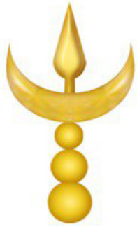
PAA -MUNŠAR-U THE ANŠARS