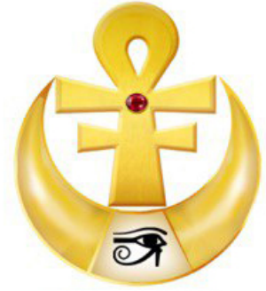
PAA-MUŠBAĪ-U THE SABAEOANS