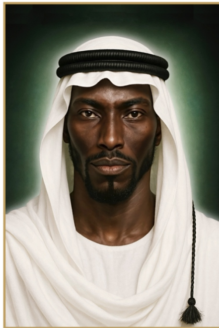
Ishmael son of Abraham and Hagar MUÀRAB-U “Arab” The First Arab meaning “mixed”